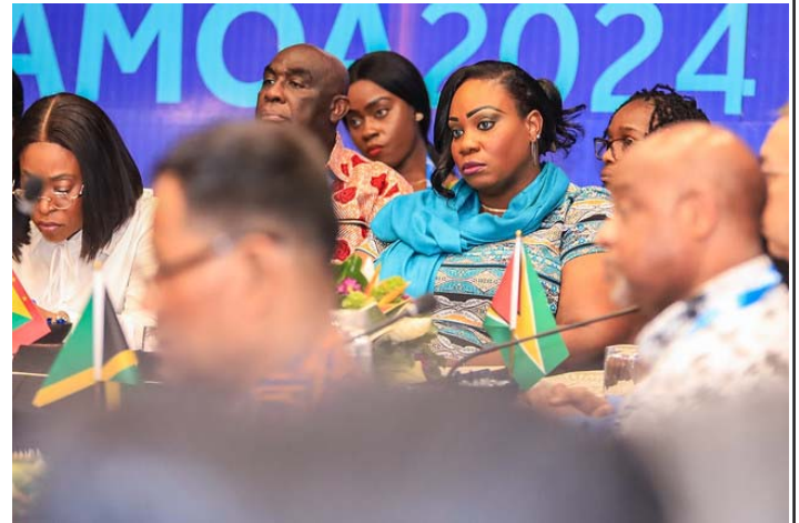
Colourful – but serious. The Commonwealth Ministers Meeting

The main thing about this week’s CHOGM is the blaze of bright colour. The people, the buildings, everywhere, the Samoans, other Pacific Islanders and most other delegates wear bright colours.