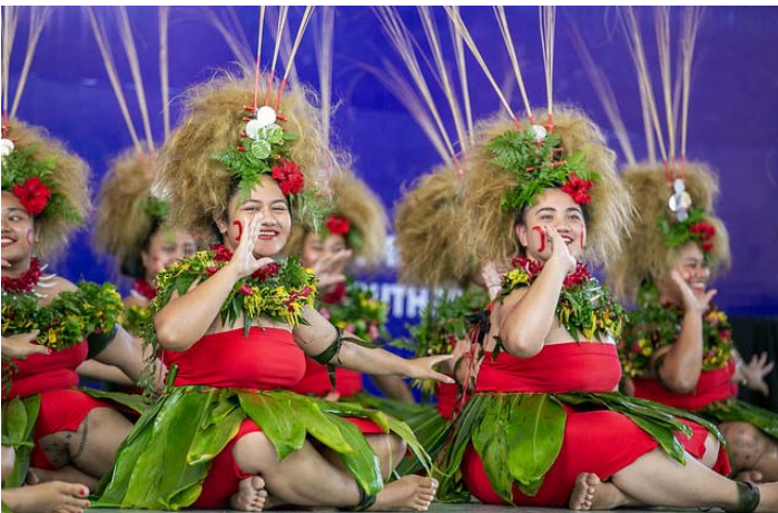
At the opening ceremony