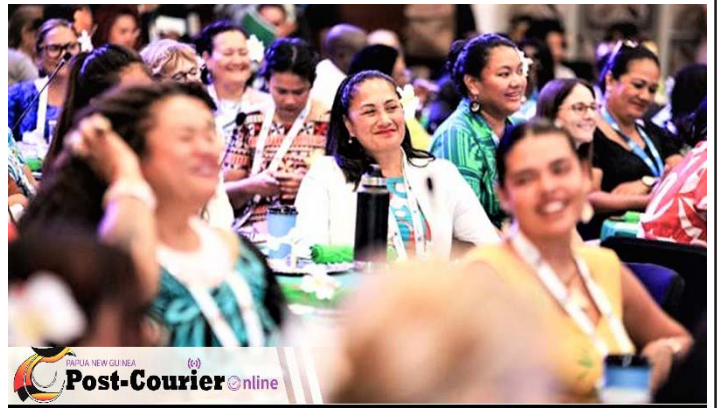
Women’s Forum – colourful and smiling