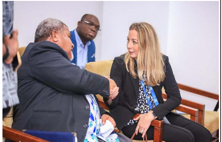
And a great time for meeting new people