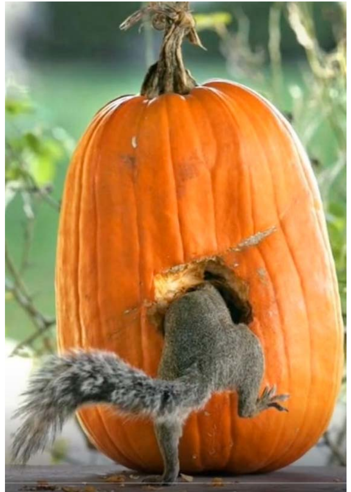
I'll be back out after Halloween

This is another confusion. It was only a few years ago the good people in the 'land of the free' would have sneered at Communist Russia for this kind of censorship. Another major reassessment required.